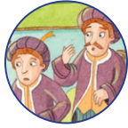
Kings men (2 or 3 children, non-speaking)