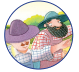
Men (2 or 3 children)