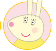
Miss Rabbit (non-speaking part)

Work with the children to allocate characters and prepare a short performance. Discuss the stage directions in advance and make sure the children understand how to follow the script.